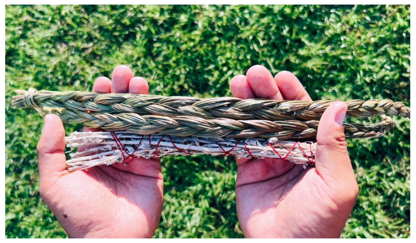
Pilamiye (Thank you)